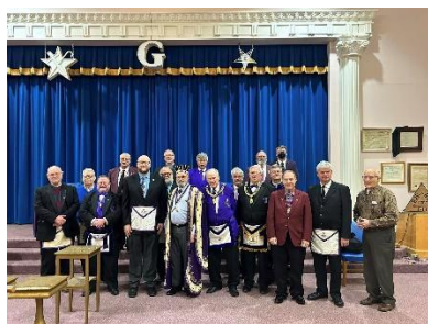
Lima #20 & Van Wert #73

I am thrilled to say that I had the privilege to serve as Guest Inspector at Bryan Council #101's Inspection back on Saturday, November 19, 2022. I also had the privilege to serve as Inspector at Springfield Council #17's Inspection on February 1, 2023. It is always good to get out and see the Companions of Cryptic Masonry, and it is nice to see how other Arches handle their business. Thank you to all of the Companions for the kindness and courtesies extended to me and the Office I represent in my Travels. You sure know how to make a guy "feel at home!"