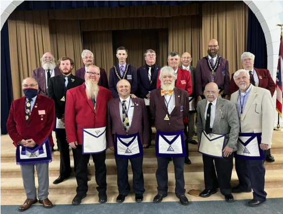
Findlay Council #50 Officer Installation (June 9, 2022)

Findlay Council #50 took on the Super Excellent Master for its Annual Inspection Degree, and did quite well. Kudos to them for “trying something a little different” within our Arch.