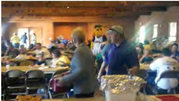
Among those joining the Companions at the Big Shots Camp was none other than Muddy, the mascot of the Toledo Mud Hens.

We donated 90 hours to the service of the Big Shots campers at Camp Libby serving breakfasts, lunches and dinners (with one companion making and donating 15 gallons of dill pickles!) The Companions also donated 8 hours to the service of the attendee's at the Little Shots camp for younger kids with diabetes.