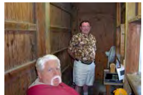
Companions of the Seventh Arch were on hand to help out at the Medina Fair.

What an honor the Fourth Arch Companions in attendance and the three new Select Masters had!